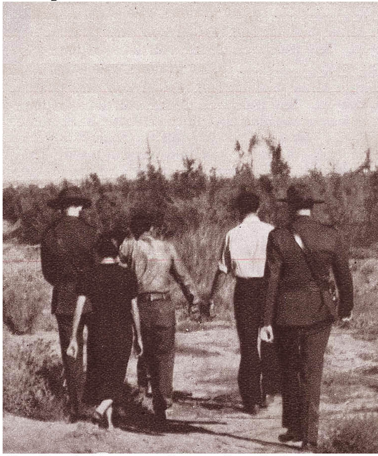
Family of aliens caught crossing the border is escorted to Border Patrol headquarters where they will be questioned

You've got to be young—and healthy. You may be bored or you may be shot. You'll freeze and fry. It won't make a man of you because you're that if you get in. So, meet the