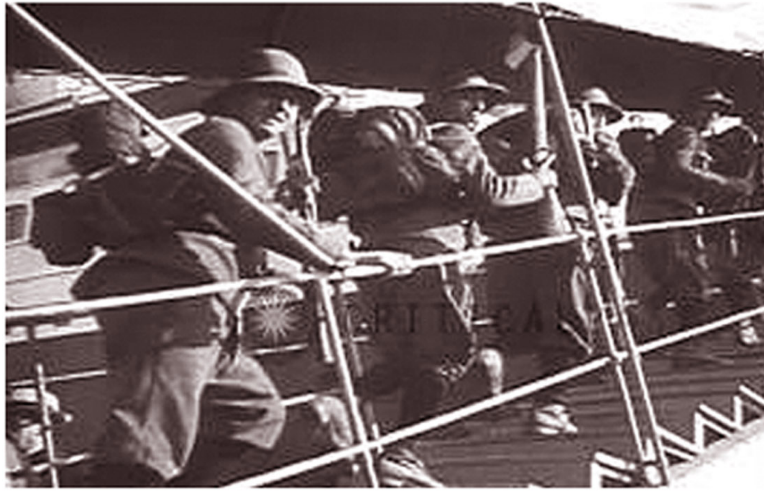
Italian troops boarding a transport at Naples for Africa

Possibilities of Conflict in Africa Are Discussed in America by Mussolini's Countrymen and Negro Admirers of Haile Selassie