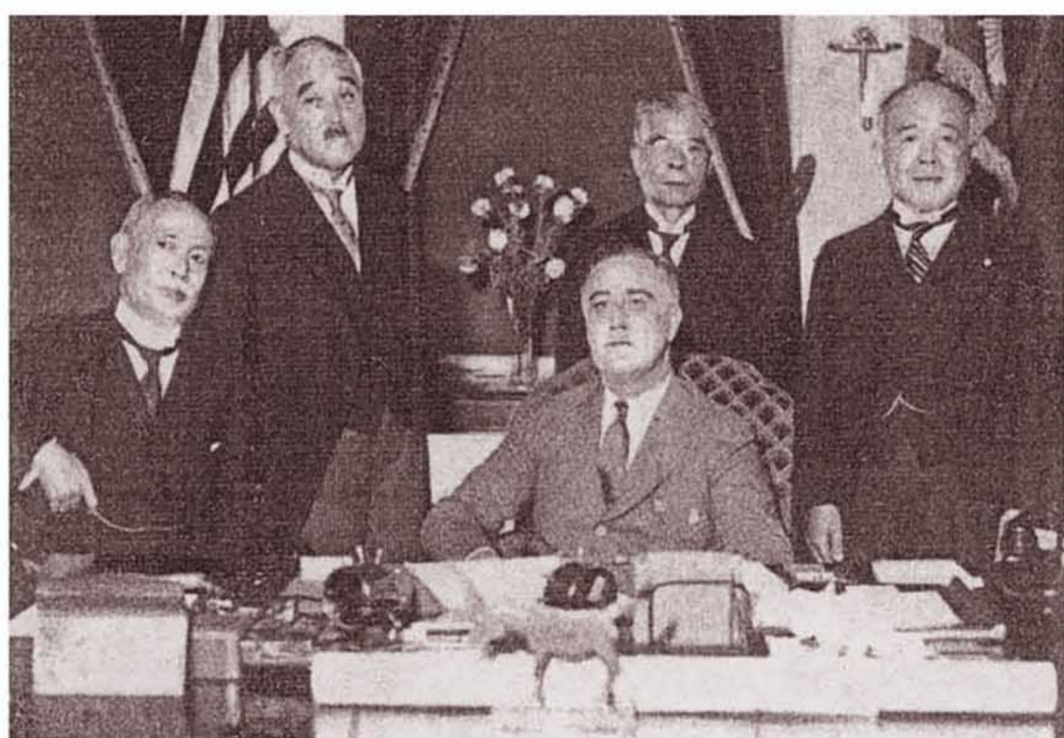
For "World Peace and Prosperity"