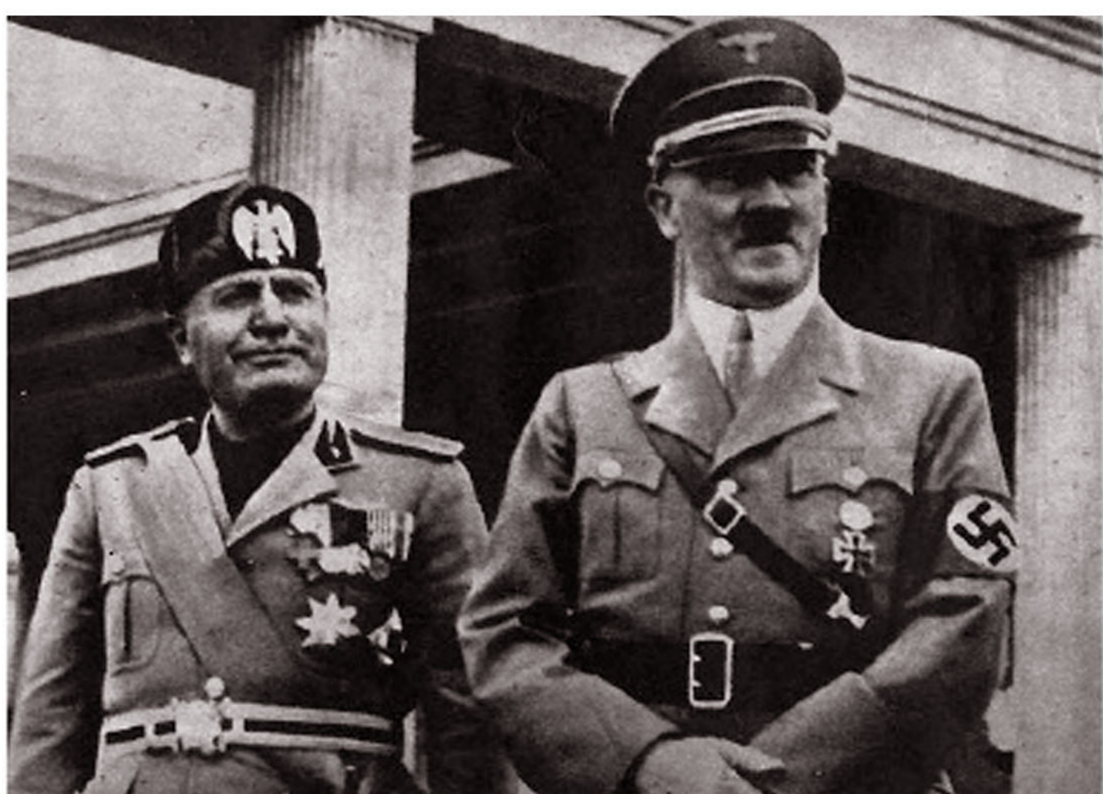
THESE BOYS know that it pays to put on a good show. They have developed the knack of fooling their public by obscuring real issues behind clouds of pagantry and invective. Will free, democratic America ever fall for the same sort of thing?