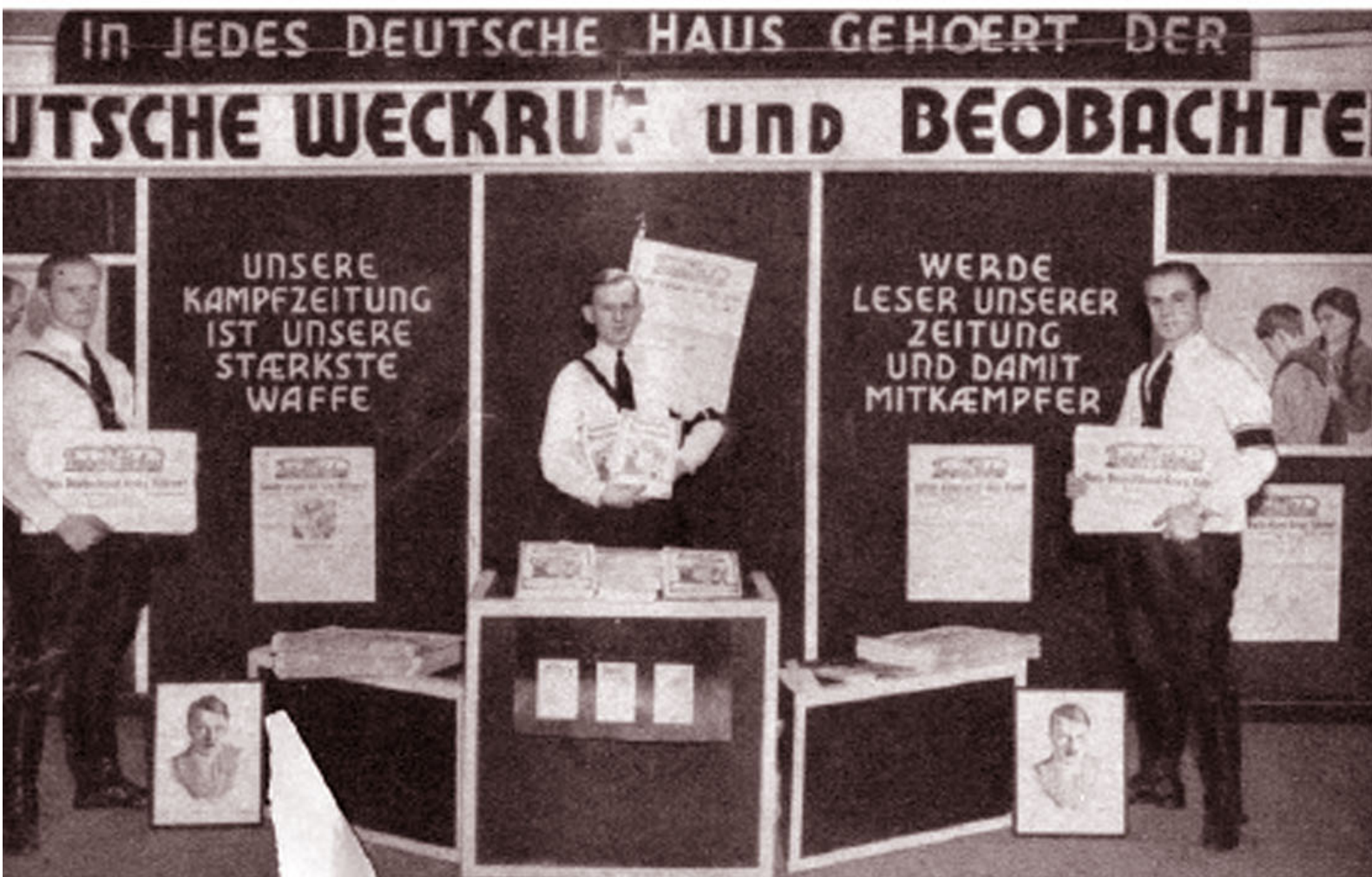
THIS BOOTH was a feature of a Nazi celebration in New York's Madison Square Garden last year. It advertised the German Awakener and Observer, official newspaper of the Nazis in America. Note the uniformed attendants on duty and the pictures of Adolf Hitler.

T HE PICTURES on these pages were not made in Germany. They may look like accurate shots of a foreign political movement—which they are—but they were made right here in these United States. Almost coincidentally with Hitler's assumption of power in the Reich, our free democracy began to feel the long paw of Nazi propaganda. Overnight there sprang up on a national scale a Friends of New Germany, its program incorporating all the repression and racial persecution of the Nazified fatherland. Starting from hushed meetings, nursed on literature and perhaps funds from the homeland, the movement grew more open, more bold, until it found itself in the midst of a first-class Congressional investigation. Ensuing publicity made the Friends dissolve, but it was immediately replaced by the German-American Bund, which has continued the drive for a Nazi America. German and American Nazis continually deny that they have any connection with each other; yet Ambassador Dieckhoff has addressed meetings attended by Bund members and Hitler has received Bund officials in Berlin. In 60 American counties, on 22 American camp sites, alien-fostered forces drill and agitate to end our democracy.