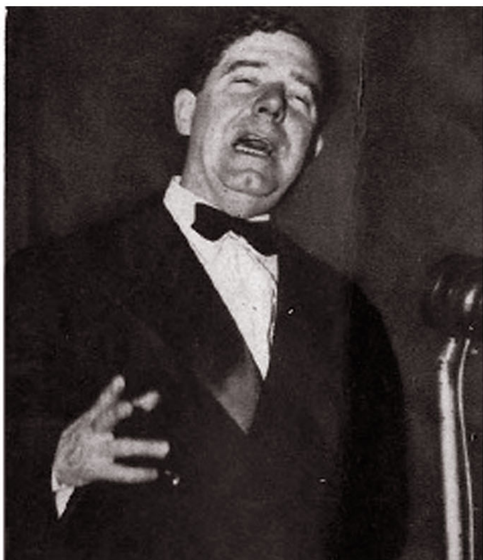
HUEY LONG was America's nearest approach to the Fascist-dictator menace. The mob that wants something for nothing liked Huey's wild promises.