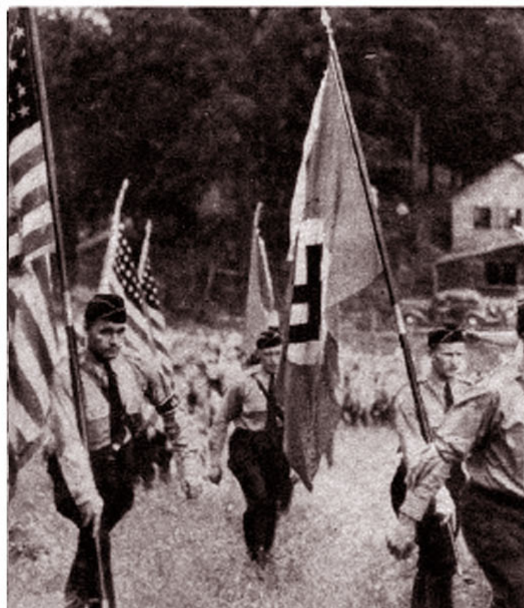
ON PUBLIC MARCHES they make sure to carry Old Glory. But here the German Nazi flag precedes it during a parade at Camp Nordland, N. J. At camps like this all over the U. S. the Nazis drill for "the new day".