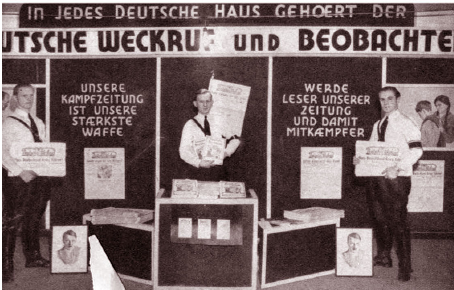
THIS BOOTH was a feature of a Nazi celebration in New York's Madison Square Garden last year. It advertised the German Awakener and Observer, official newspaper of the Nazis in America. Note the uniformed attendants on duty and the pictures of Adolf Hitler.

T HE PICTURES on these pages were not made in Germany. They may look like accurate shots of a foreign political movement—which they are—but they were made right here in these United States. Almost coincidentally with Hitler's assumption of power in the Reich, our free democracy began to feel the long paw of Nazi propaganda. Overnight there sprang up on a national scale a Friends of New Germany, its program incorporating all the repression and racial persecution of the Nazified fatherland. Starting from hushed meetings, nursed on literature and perhaps funds from the homeland, the movement grew more open, more bold, until it found itself in the midst of a first-class Congressional investigation. Ensuing publicity made the Friends dissolve, but it was immediately replaced by the German-American Bund, which has continued the drive for a Nazi America. German and American Nazis continually deny that they have any connection with each other; yet Ambassador Dieckhoff has addressed meetings attended by Bund members and Hitler has received Bund officials in Berlin. In 60 American counties, on 22 American camp sites, alien-fostered forces drill and agitate to end our democracy.