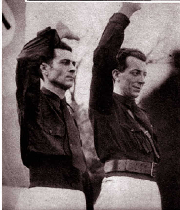
ONE AIM of the Bund is to unite all Fascist elements in America. These Italian Blackshirts attend a drill at Camp Siegfried, Long Island.