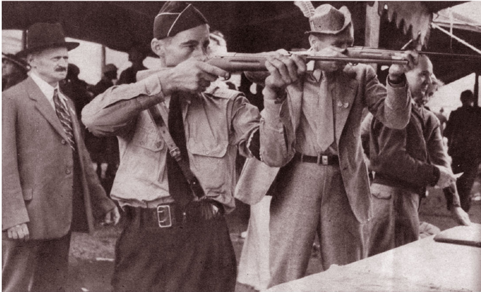
TARGET PRACTICE gives American Nazis a chance to become adept with arms. They dare not drill with guns in public, but they welcome handling them.

T HE PICTURES on these pages were not made in Germany. They may look like accurate shots of a foreign political movement—which they are—but they were made right here in these United States. Almost coincidentally with Hitler's assumption of power in the Reich, our free democracy began to feel the long paw of Nazi propaganda. Overnight there sprang up on a national scale a Friends of New Germany, its program incorporating all the repression and racial persecution of the Nazified fatherland. Starting from hushed meetings, nursed on literature and perhaps funds from the homeland, the movement grew more open, more bold, until it found itself in the midst of a first-class Congressional investigation. Ensuing publicity made the Friends dissolve, but it was immediately replaced by the German-American Bund, which has continued the drive for a Nazi America. German and American Nazis continually deny that they have any connection with each other; yet Ambassador Dieckhoff has addressed meetings attended by Bund members and Hitler has received Bund officials in Berlin. In 60 American counties, on 22 American camp sites, alien-fostered forces drill and agitate to end our democracy.