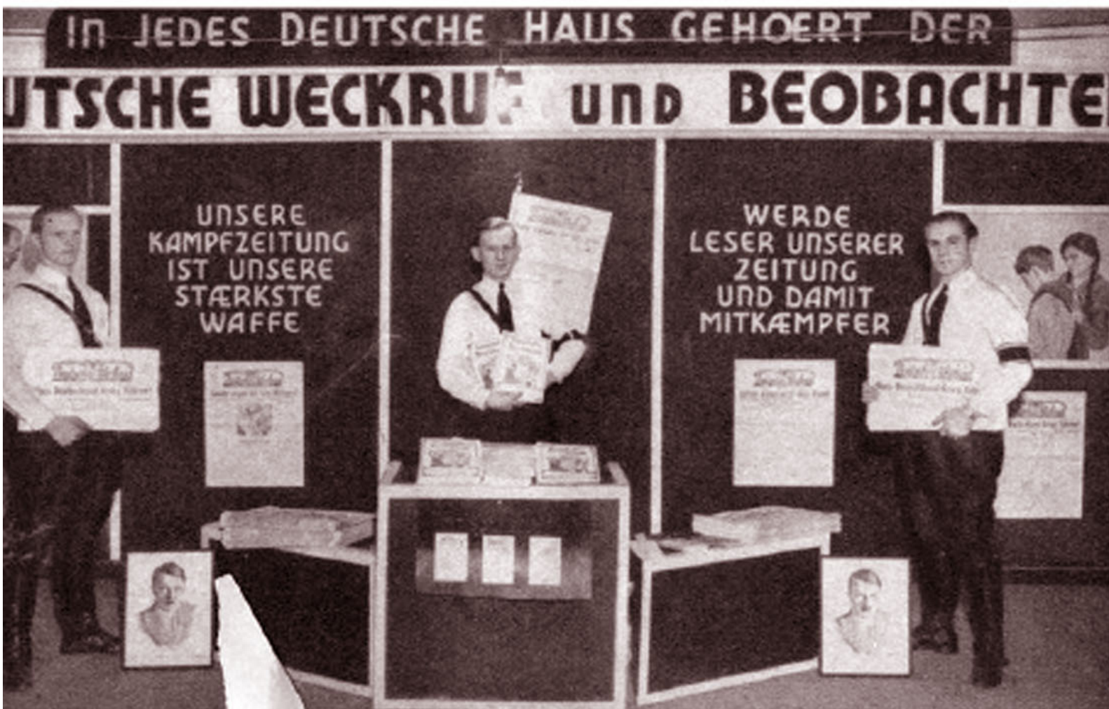
THIS BOOTH was a feature of a Nazi celebration in New York's Madison Square Garden last year. It advertised the German Awakener and Observer, official newspaper of the Nazis in America. Note the uniformed attendants on duty and the pictures of Adolf Hitler.

T HE PICTURES on these pages were not made in Germany. They may look like accurate shots of a foreign political movement—which they are—but they were made right here in these United States. Almost coincidentally with Hitler's assumption of power in the Reich, our free democracy began to feel the long paw of Nazi propaganda. Overnight there sprang up on a national scale a Friends of New Germany, its program incorporating all the repression and racial persecution of the Nazified fatherland. Starting from hushed meetings, nursed on literature and perhaps funds from the homeland, the movement grew more open, more bold, until it found itself in the midst of a first-class Congressional investigation. Ensuing publicity made the Friends dissolve, but it was immediately replaced by the German-American Bund, which has continued the drive for a Nazi America. German and American Nazis continually deny that they have any connection with each other; yet Ambassador Dieckhoff has addressed meetings attended by Bund members and Hitler has received Bund officials in Berlin. In 60 American counties, on 22 American camp sites, alien-fostered forces drill and agitate to end our democracy.