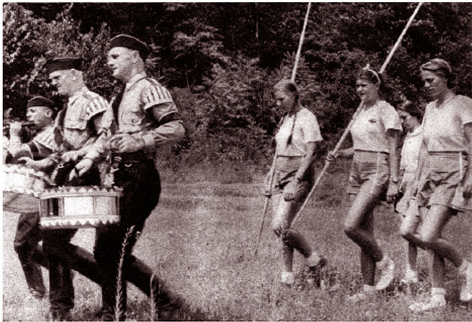
THE CHILDREN say they would run away if their parents didn't make them stay," a liberal German-American newspaper reported of Camp Nordland. "The general atmosphere is that of a penitentiary".