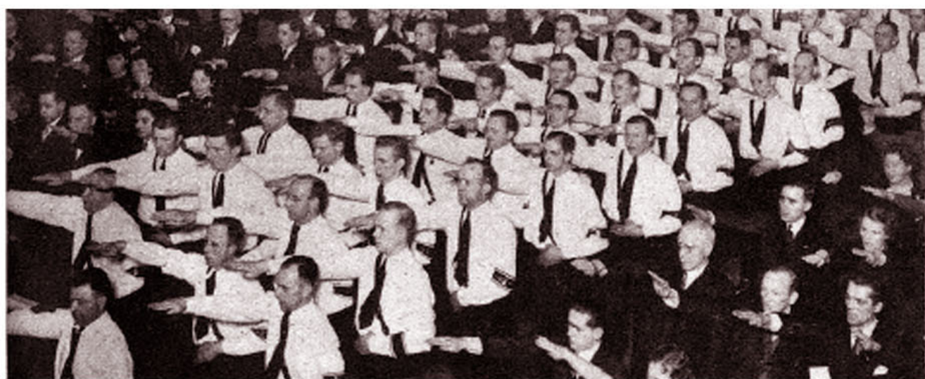
THE STORM TROOPS of the Nazis in America are the uniformed Ordnungsdienst . Their early uniforms were smuggled in from Germany; later they adopted the ones shown here; today they have more elaborate outfits.