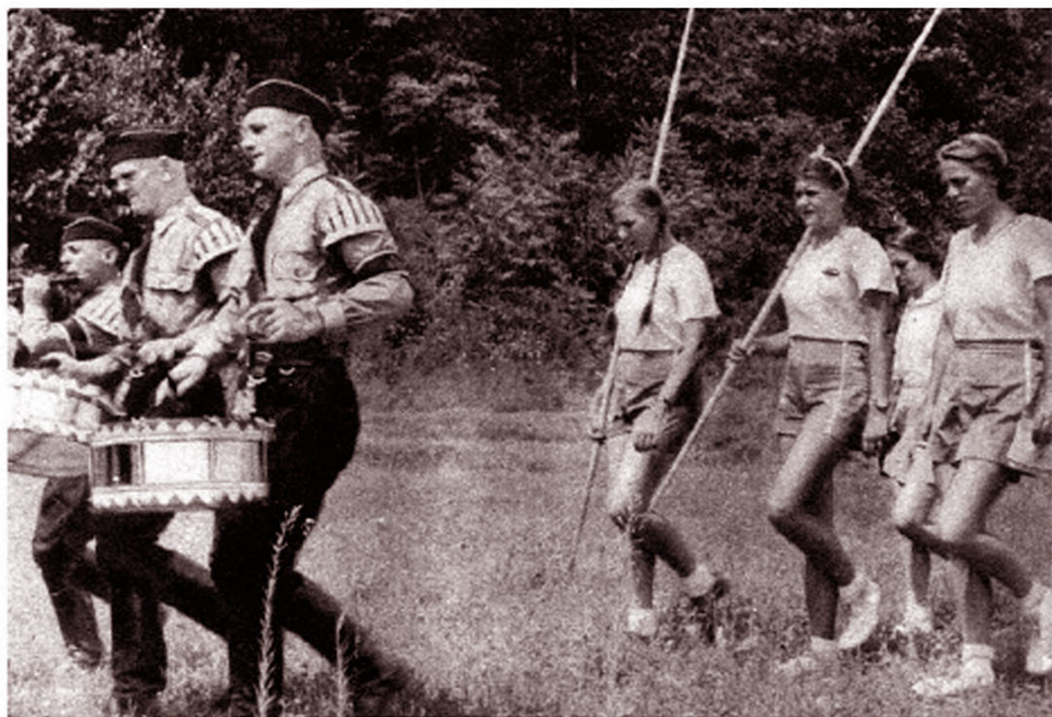
THE CHILDREN say they would run away if their parents didn't make them stay," a liberal German-American newspaper reported of Camp Nordland. "The general atmosphere is that of a penitentiary".