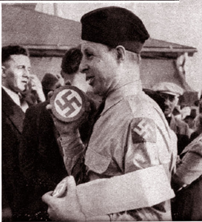
"WHO'LL BUY my nice swastikas?" cries a hawker at Siegfried. The sign above, at the same camp, says: "BRONX POST—FOR CHRISTIANS ONLY".