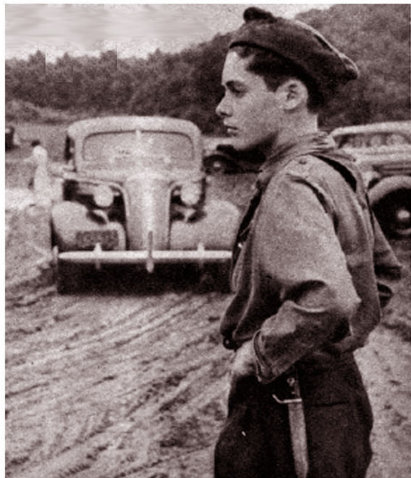
YOUTH MUST learn the ways of strife. A knife may be an innocent thing, but not when it's coupled with doctrines of hate.