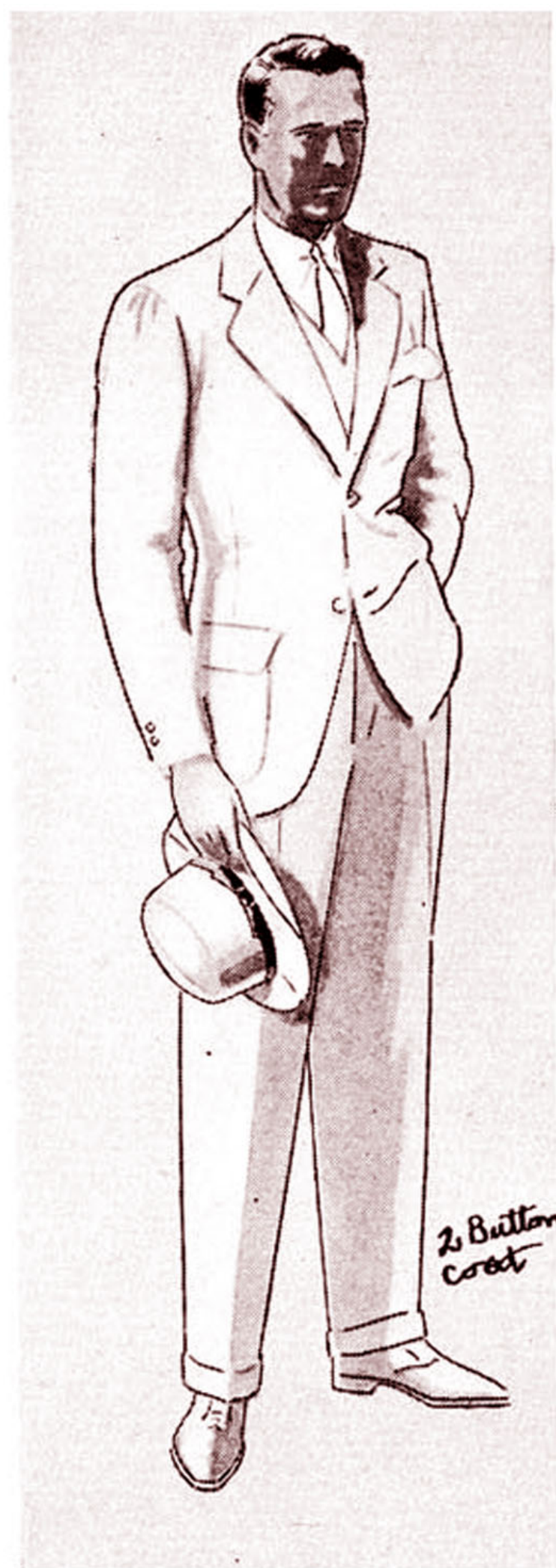
2 Button Coat