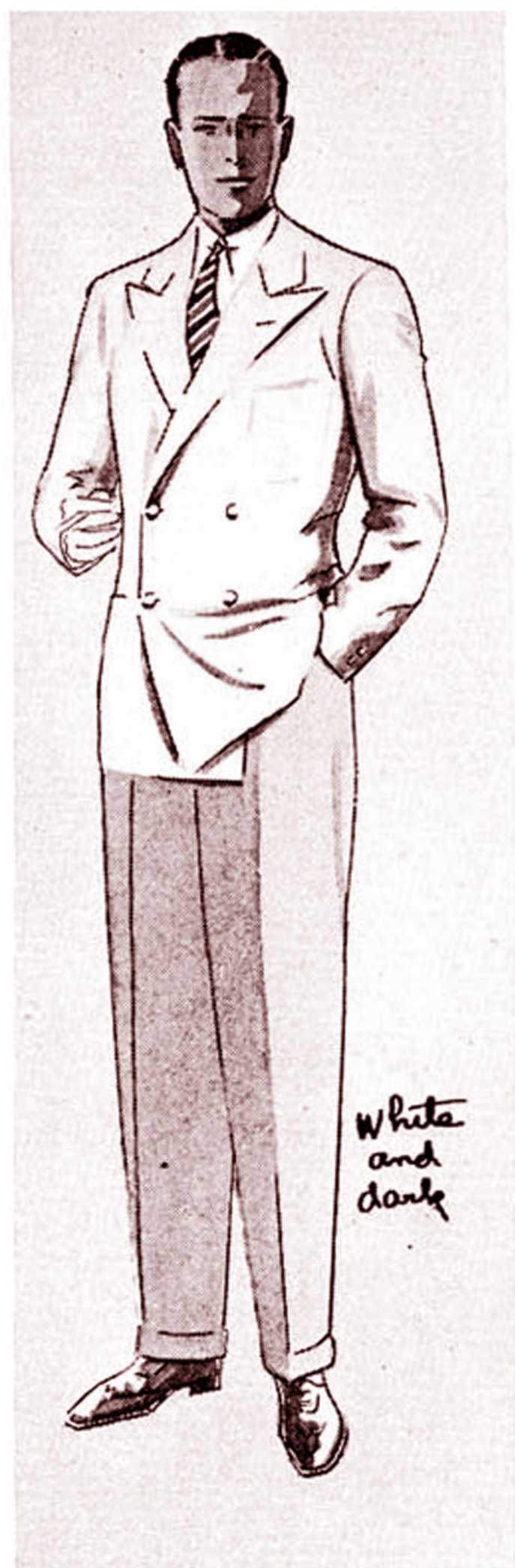
White and dark

New White Palm Beach Suit —in raised weave. Coat cut on smart “man-about-town” lines. Two-button, with well defined waistline.