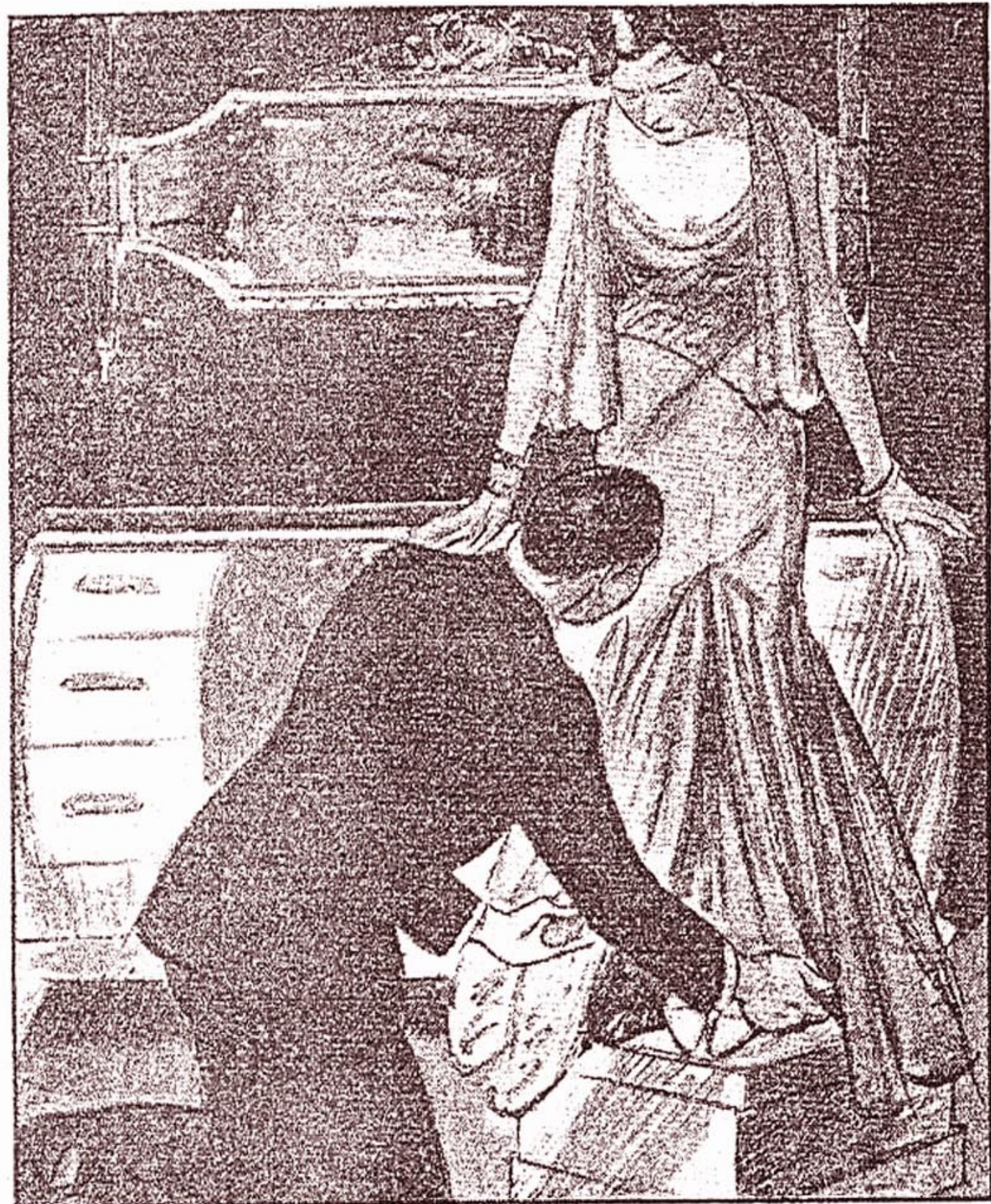
AT THE MERCY OF HER ANCIENT TYRANT

Modern woman's relation to the Parisian man-milliner, as viewed by an artist, who evidently sympathizes with the fair victim.