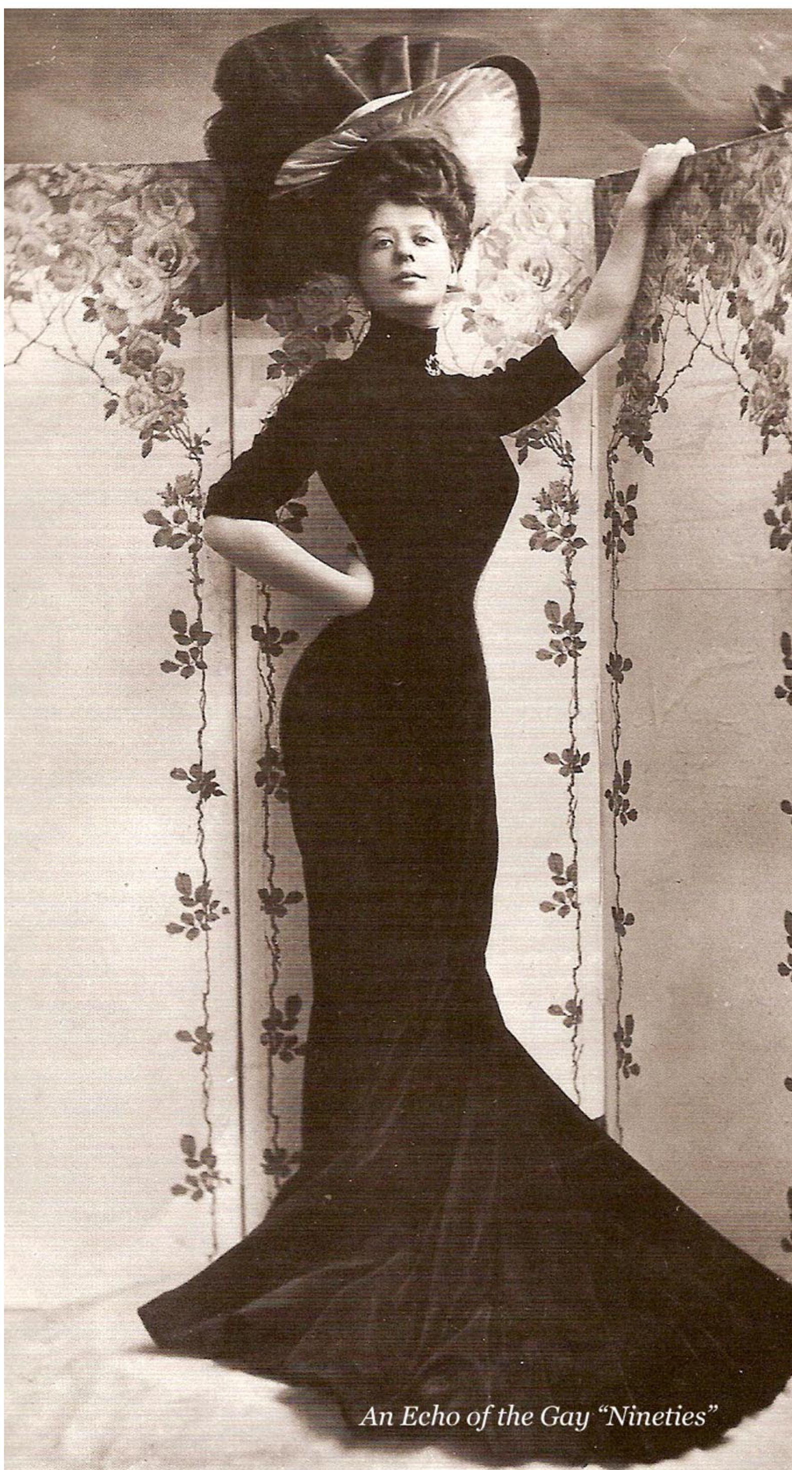
An Echo of the Gay "Nineties"

come-back in styles and accessories long relegated to the attic, and why?