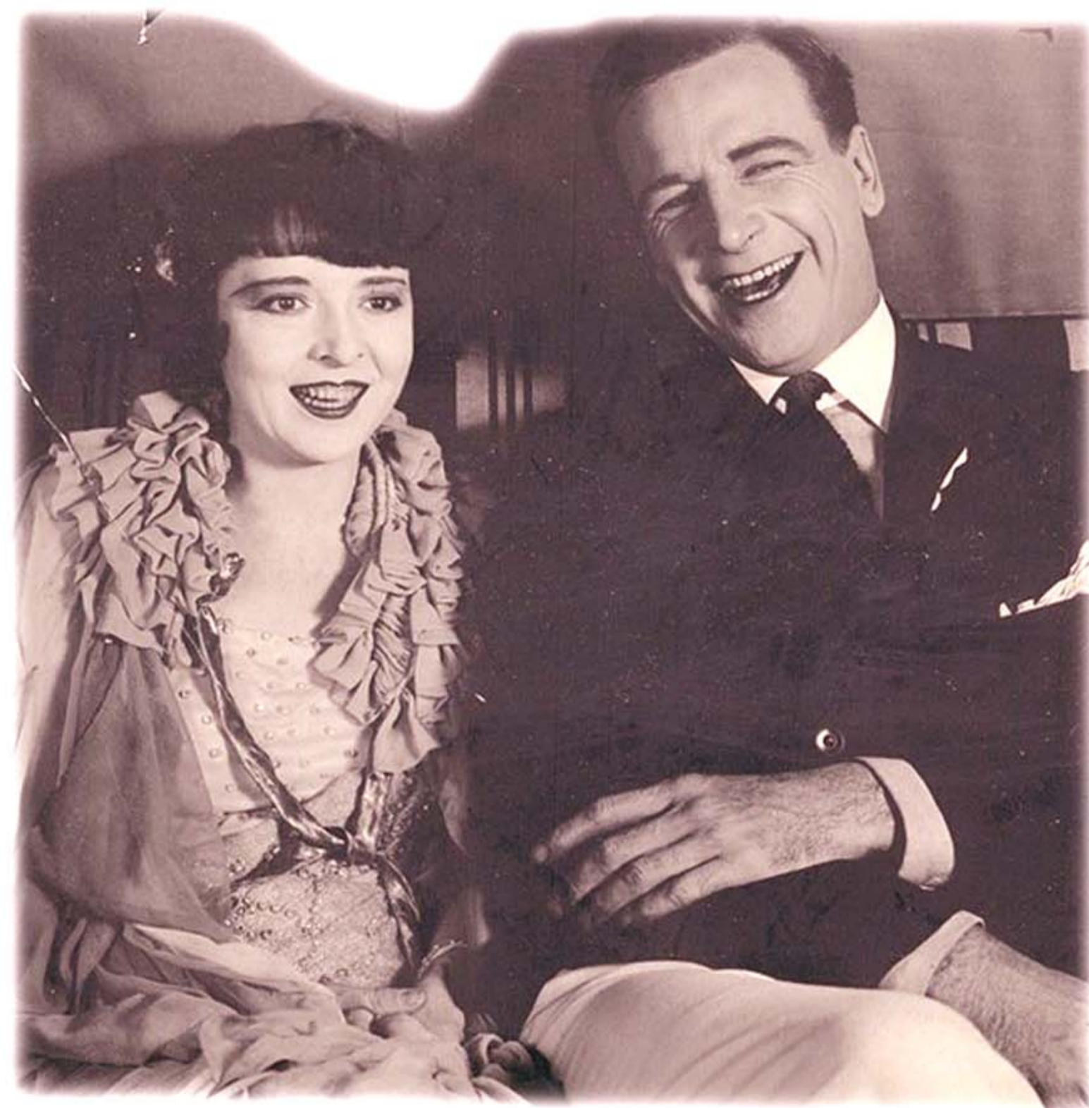
Colleen Moore and Milton Sills as seen in Flaming Youth (1923)

Flaming Youth endeavors to establish that young men and maidens wild are going up in the smoke of their own cigarettes. It contains all the rabble of trashy devices which cinema directors employ traditionally to indicate the younger degeneration, even to the midnight bathing party. All this is unfortunate, since the story of the socially rabid mother who on her deathbed persuaded her physician to write her spirit letters of her daughter's progress, is rather ingenious. She gave the girl the combination of the safe where the letters were to be left, hoping that the reports and reflections therein would fortify her philosophy against a jazz-mad world. Milton Sills and Colleen Moore make much of the leading rôles.