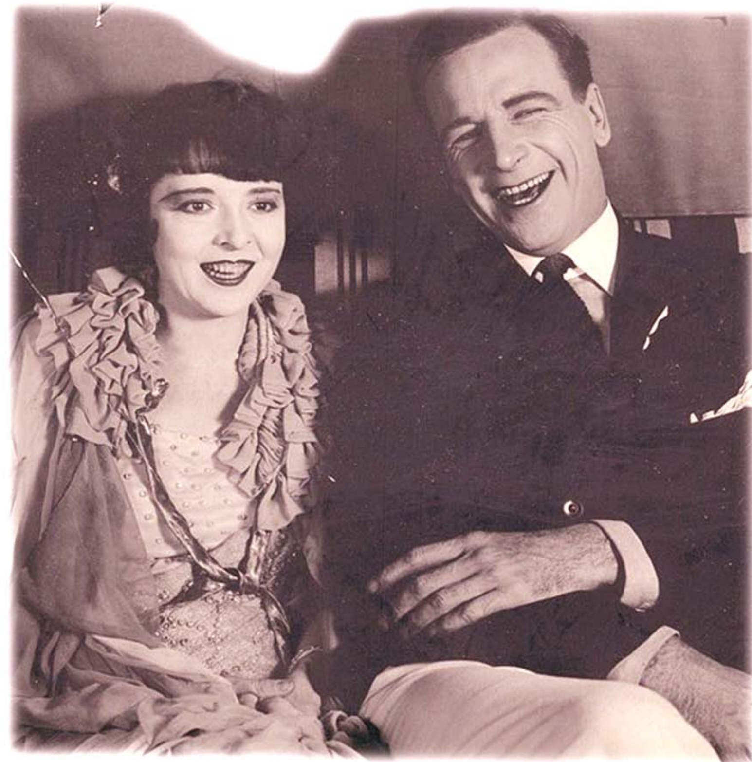
Colleen Moore and Milton Sills as seen in Flaming Youth (1923)

Flaming Youth endeavors to establish that young men and maidens wild are going up in the smoke of their own cigarettes. It contains all the rabble of trashy devices which cinema directors employ traditionally to indicate the younger degeneration, even to the midnight bathing party. All this is unfortunate, since the story of the socially rabid mother who on her deathbed persuaded her physician to write her spirit letters of her daughter's progress, is rather ingenious. She gave the girl the combination of the safe where the letters were to be left, hoping that the reports and reflections therein would fortify her philosophy against a jazz-mad world. Milton Sills and Colleen Moore make much of the leading rôles.