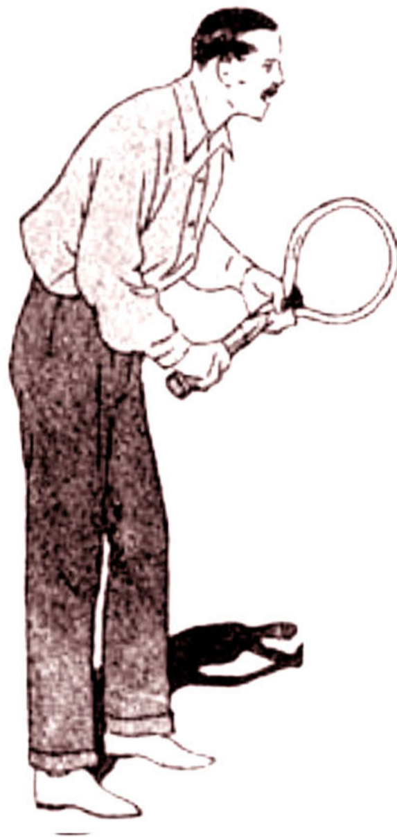
(4) Sketch of cotton cheviot shirt and trousers for tennis in two shades of grey, the trousers darker