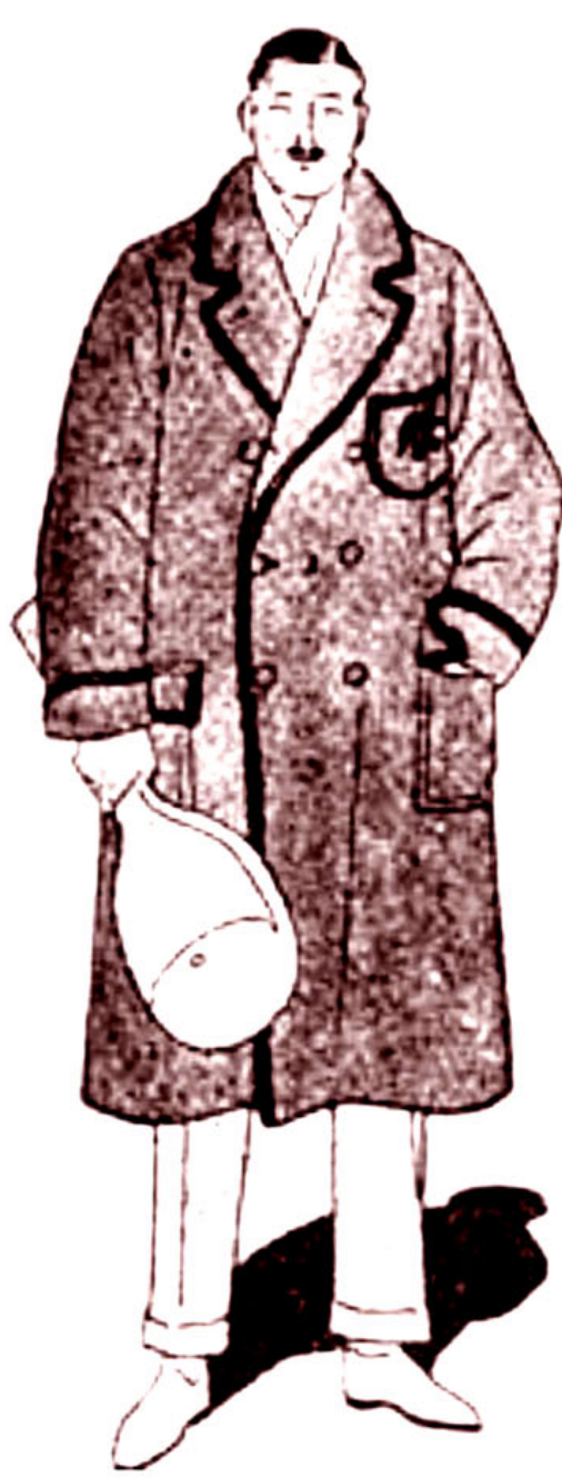
(8) Sketch for a tennis rest coat, of grey fleece bound in bright blue with club insignia on the pocket