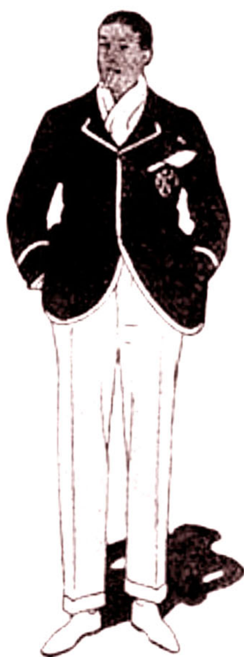
(7) Sketch for a blue club jacket. Bound in primrose, with club initials on the pocket