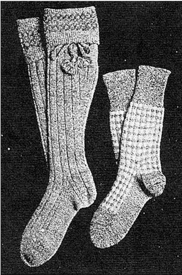
Golf stockings with permanent garter $5 a pair Tennis socks, Scotch wool—$2

I have found in my wanderings some specially designed gloves, which have a new feature in a pleat, set in the back of the right hand, which expands with the bending of the knuckles. The stockings are an innovation in that they have a neat, permanent garter. En passant , the tennis socks, of Scotch wool, in various colors, are soft, comfortable and absorbent.