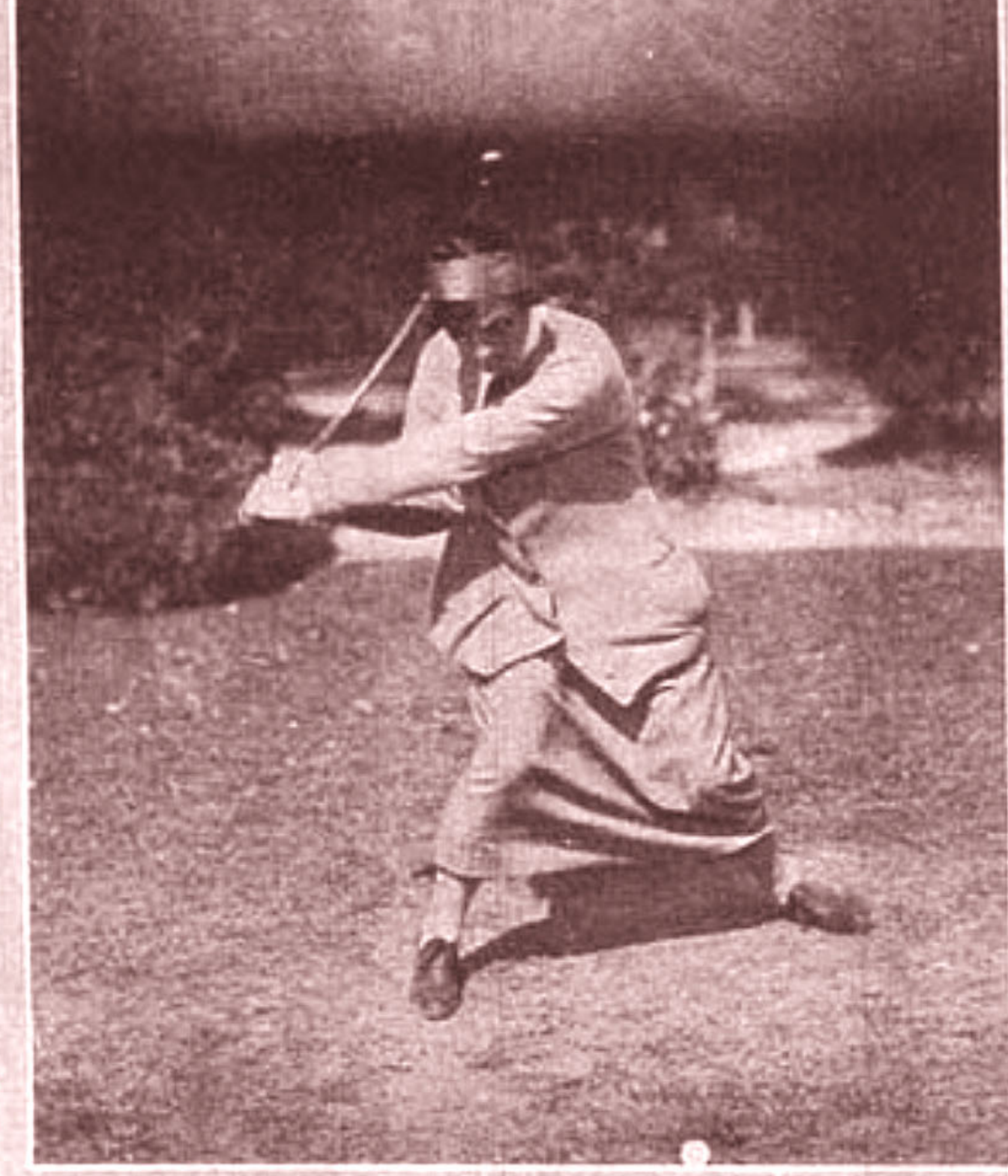
HALF WAY UP

Note the straight left arm and the beginning of the somewhat low crouch