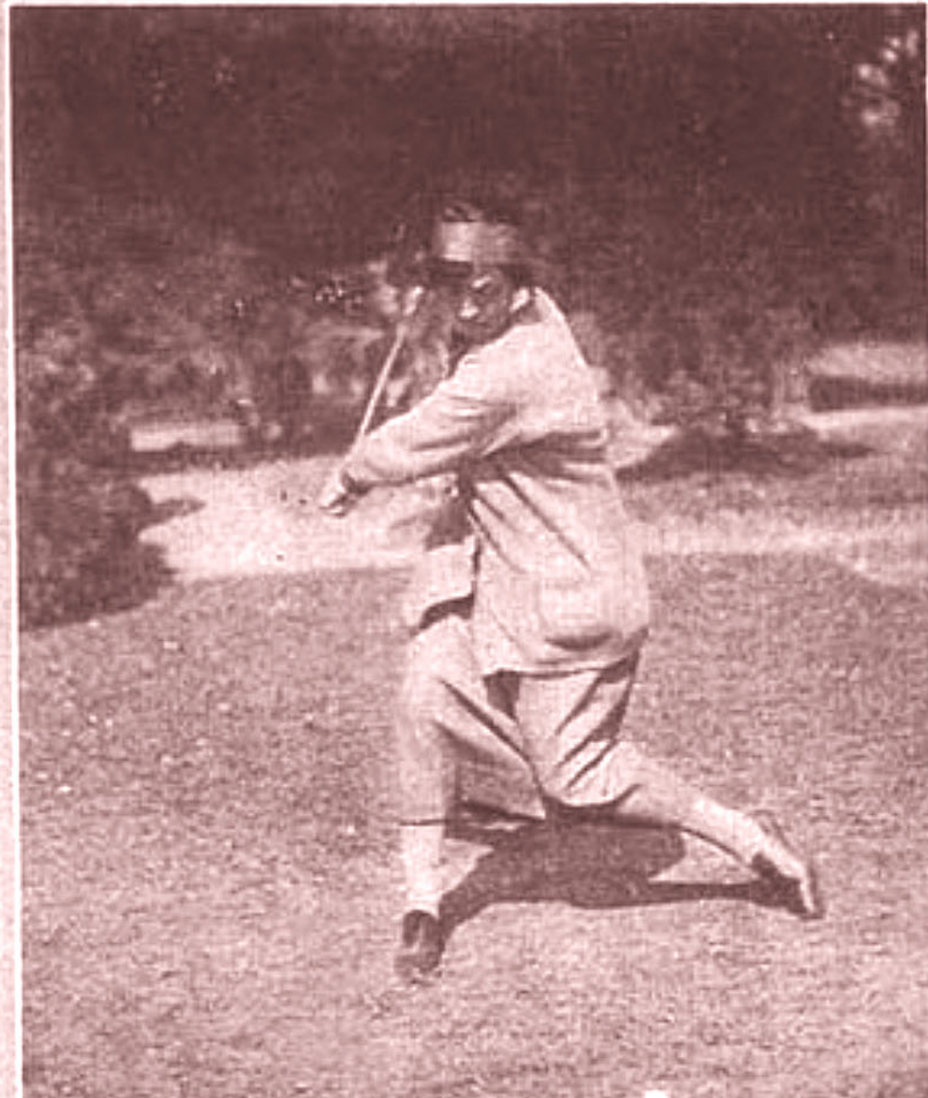
HALF WAY DOWN

The head has not moved and the left arm is still singularly straight