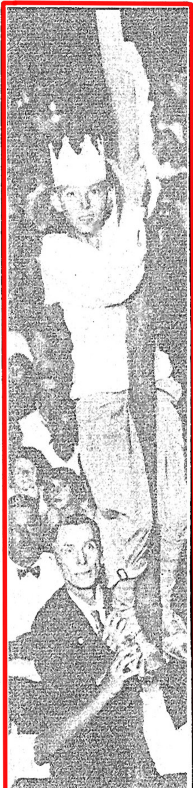
HAIL TO THE CHIEF!