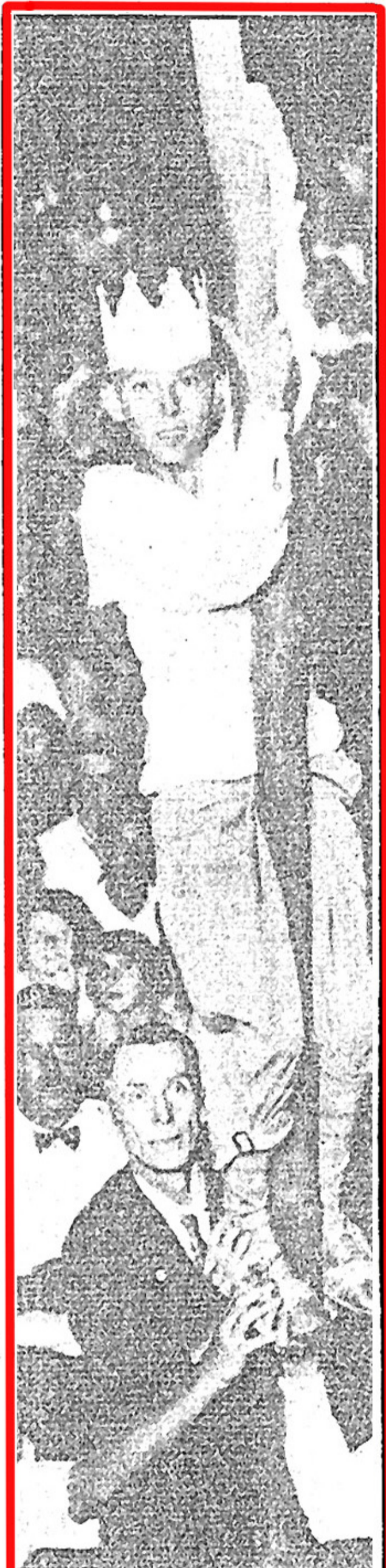
HAIL TO THE CHIEF!