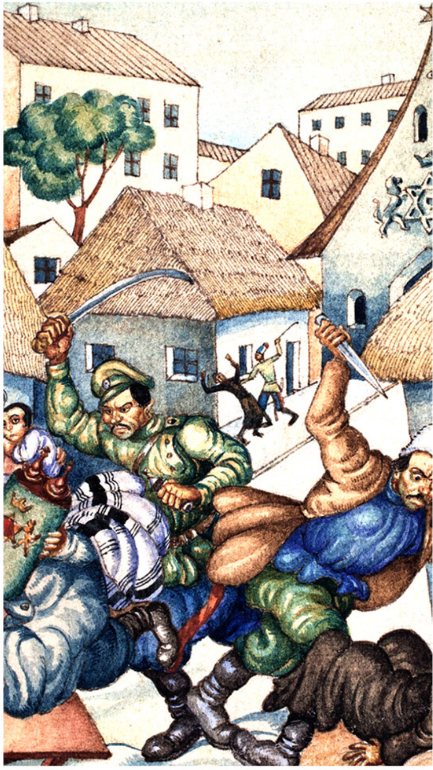
Arthur Szyk (1923)

"Should any of those murderers blasphemously allege religion as a pretext, we wish to be the first to brand them as lying hypocrites, enemies of Christ and blots on the human race."