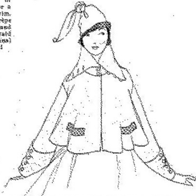
Sports in the country shall shortly entertain this gay new type of jacket and cap made of Jodre blue jersey cloth and designed by Lucie Hamar. The hat is knotted at the tip of the crown, tapering to a pointed end and its brim is lined with rough sea grass. The lower coat is simply provided with cuffs and collar, its only foreign trimming being two little pocket tabs of crepe. All models except one at upper left imported by Clarksville, Inc.