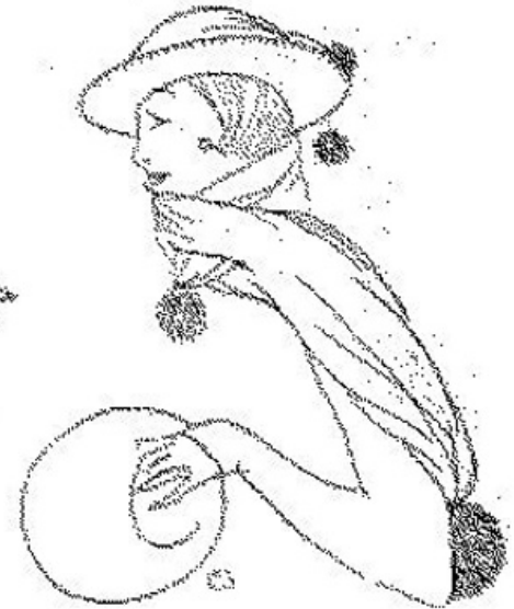
A Wedgwood green jersey cloth scarf has a chiffon lining and repeats in repeat color. The hat, to match, is buttonholed with wavyed. Lucie Hamar model