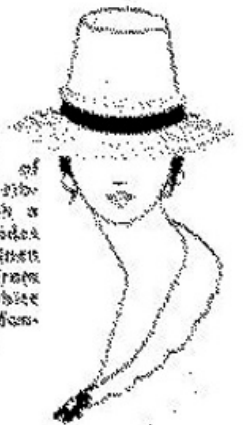
A single band of dark blue moiré ribbon fastened with a steel buckle divided an old blue linen witch's crown from its brim of white cotton fringe. Mon-jeret model