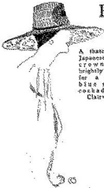
A tattered roof of Japanese straw for a crown and trim, brightly figured crepe for a facing and blue satin bristled cascade. Original Clarksville model