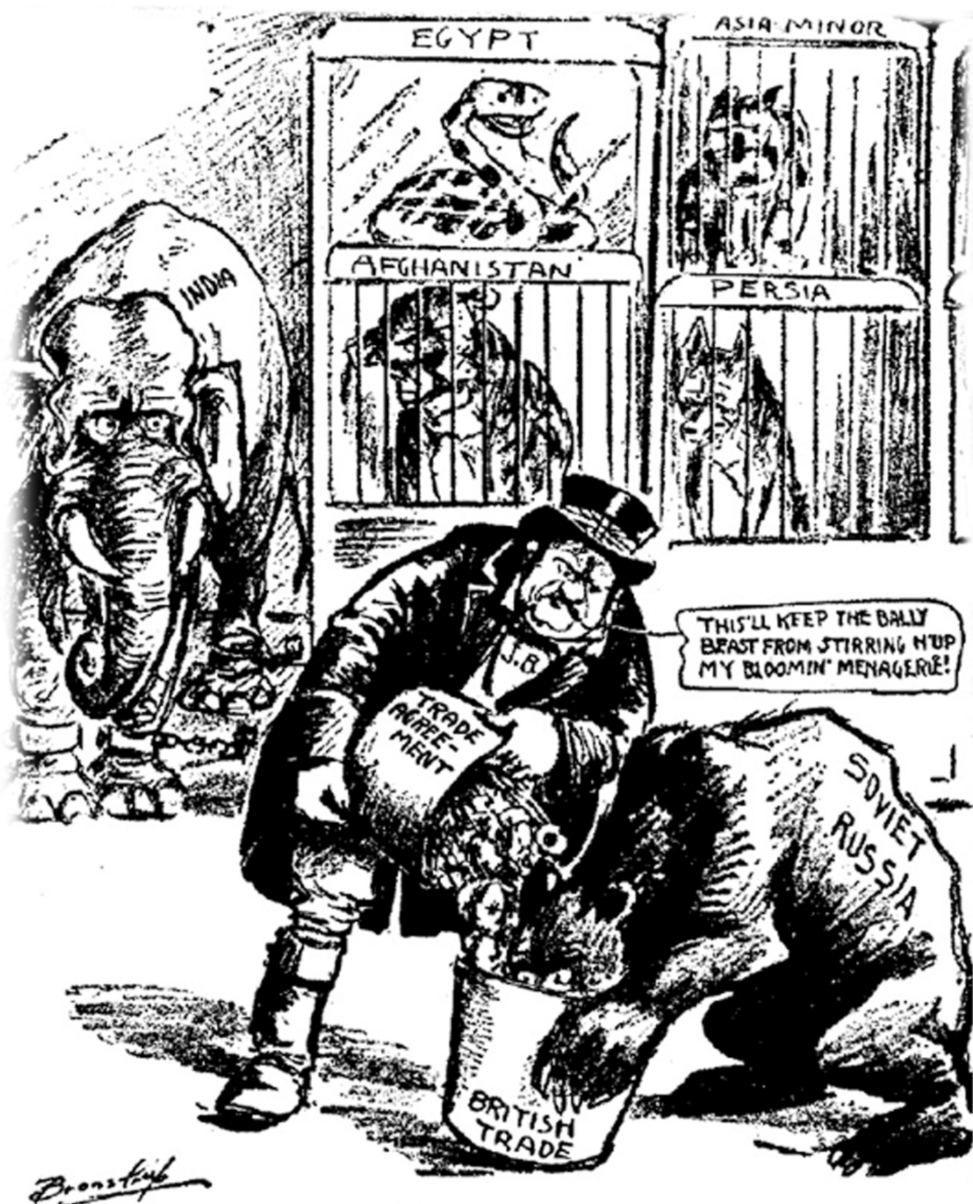
SAFETY FIRST

for it is found in conditions in Palestine that have received too little attention and which are big with the possibilities of trouble. "Another tragic chapter in the history of the Hebrews" is invited by the dreams of political Zionism, according to a writer in the Atlantic Monthly , and "there can be no question that anti-Semitism, not only in Palestine but throughout the world, will increase more and more as the world, Christian and Moslem, becomes familiar with the situation."