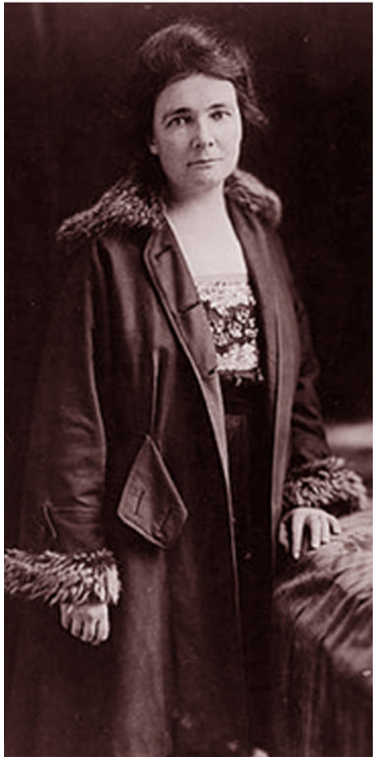
Miss Anne Martin, candidate for United States Senator from Nevada, believes that "it is necessary for the welfare of the nation that women's viewpoint should be expressed in government"