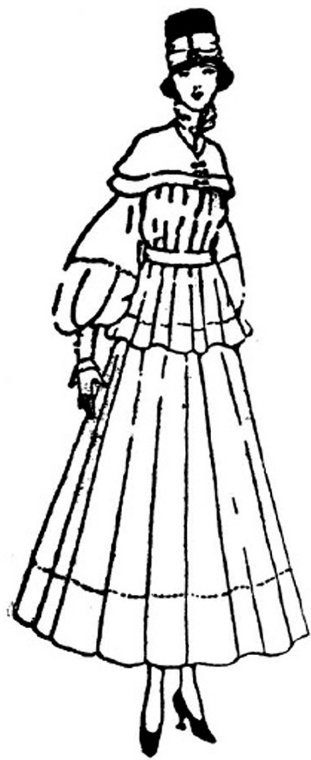
Dress of Dove Gray Cloth.

I T IS quite in line with the confusion all around that Fashion should be calling up ghosts from every period of the past to serve as models for to-day's clothes. Nothing that could lend inspiration for a new-old feature to be added to the heterogeneous lot has been too sacred to memory to drag out, and Fifth Avenue on any pleasant afternoon suggests much more the occasion of the grand march of a fancy dress ball than it does a fashionable thoroughfare of a great city. It is very exciting.