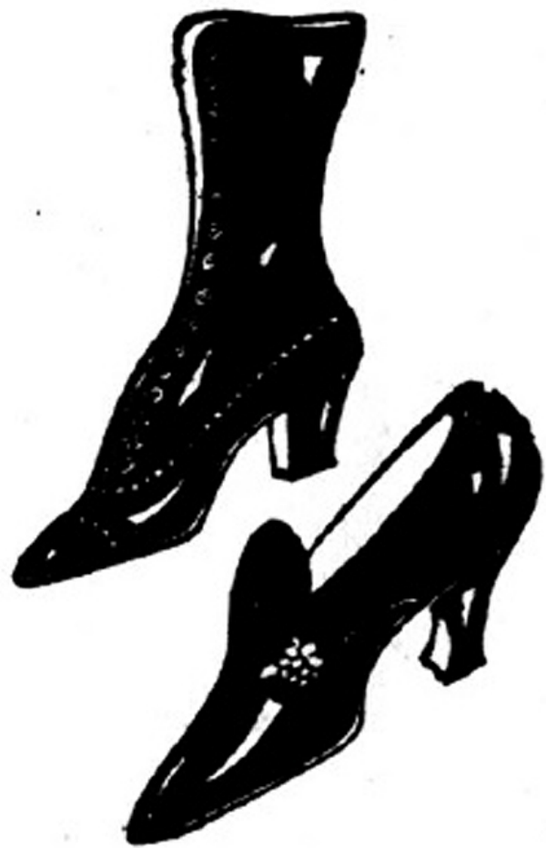
From the Early Openings.

In the shoe departments there is an interesting showing of spring wares, and while there are a number of novelties, for the most part the footgear of the coming season looks to be more sensible and infinitely more conservative than it has been for some seasons.