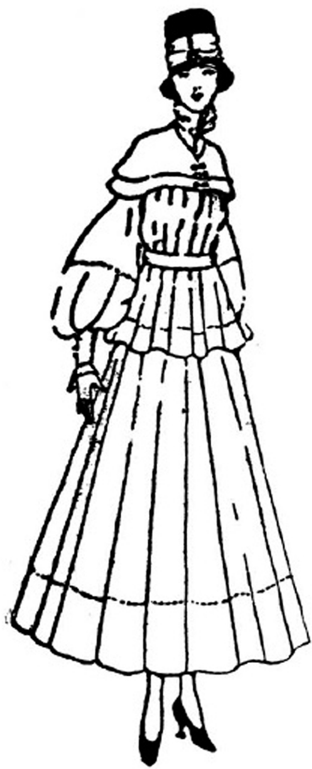
Dress of Dove Gray Cloth.

I T IS quite in line with the confusion all around that Fashion should be calling up ghosts from every period of the past to serve as models for to-day's clothes. Nothing that could lend inspiration for a new-old feature to be added to the heterogeneous lot has been too sacred to memory to drag out, and Fifth Avenue on any pleasant afternoon suggests much more the occasion of the grand march of a fancy dress ball than it does a fashionable thoroughfare of a great city. It is very exciting.