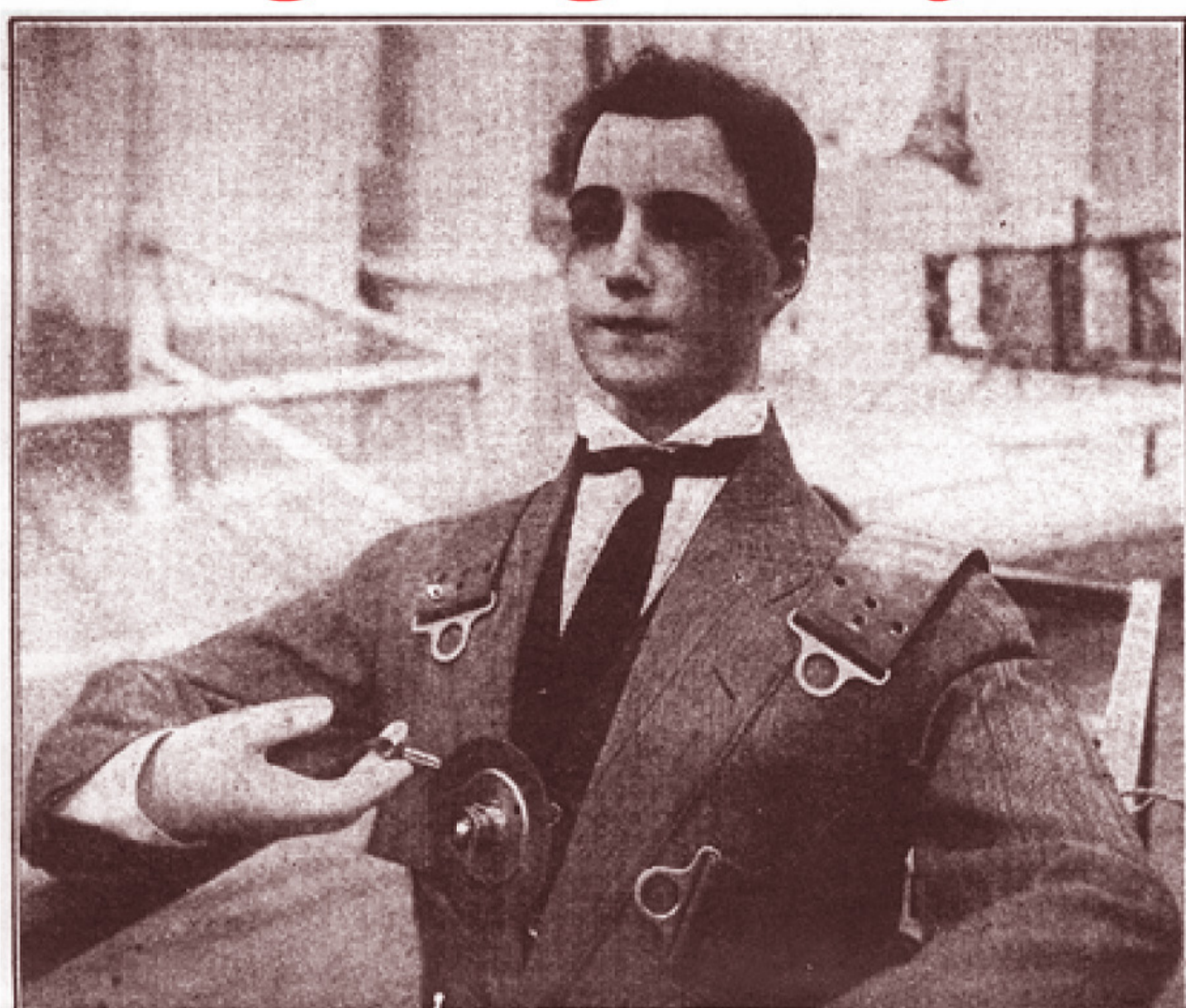
THE W. I. TWOMBLY SAFETY-HARNES.

This harness will hold the aviator to his seat in the roughest kind of weather, but will release him instantly when he pulls the cotter-pin.